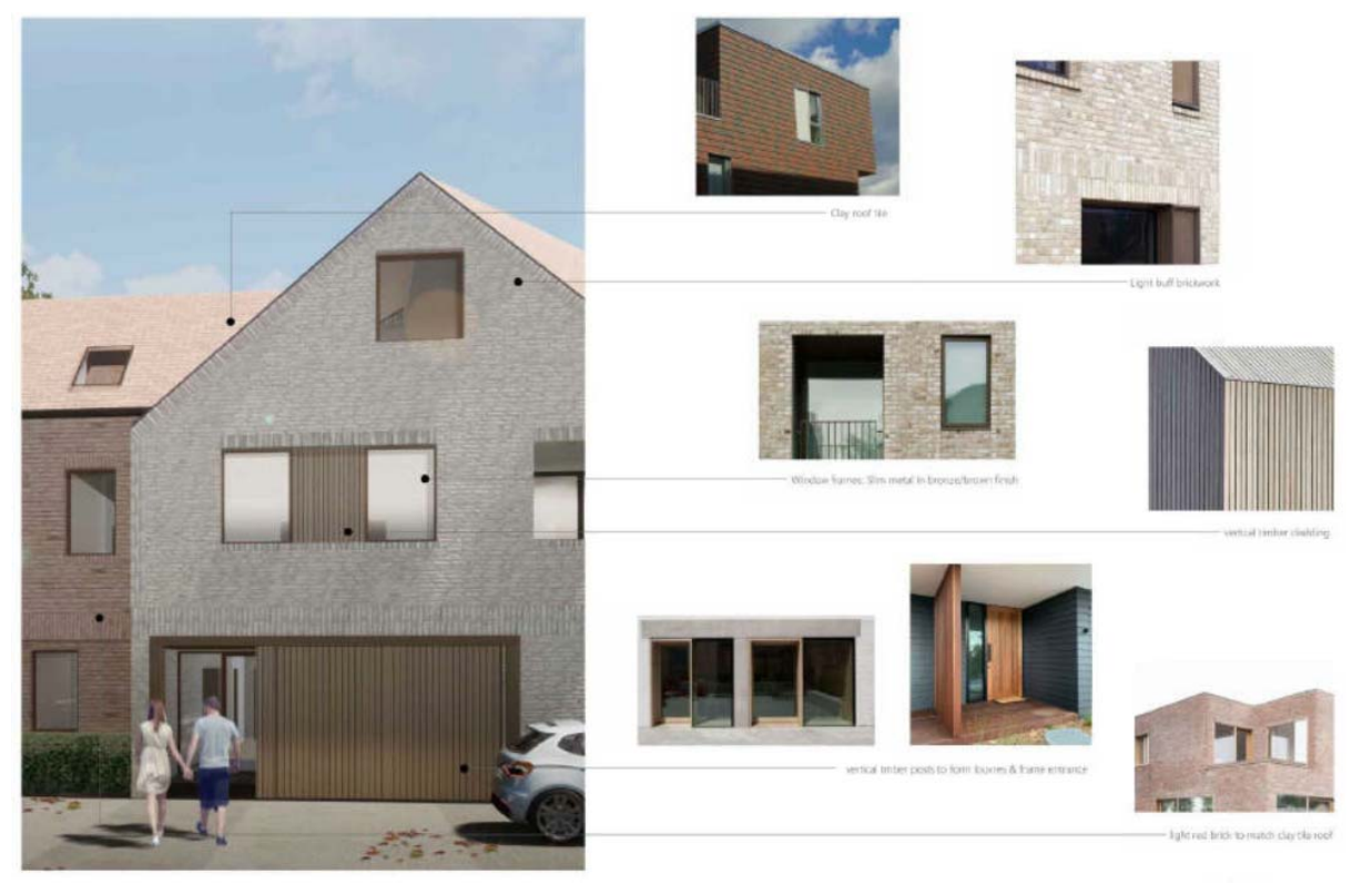
Figure 4: Indicative materials

7.20 Full details of the external materials and finishes would be secured via condition to ensure that they are of a suitable quality.