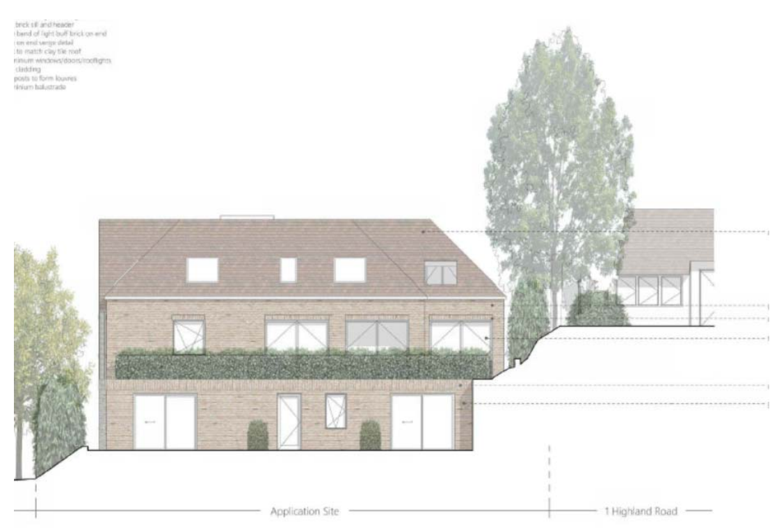
Figure 6: Plan depicting the relationship to 1 Highland Road