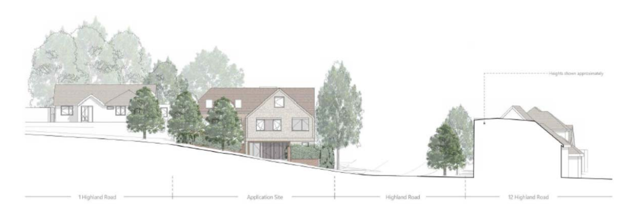
Fig 3: Proposed Streetscene Elevations

7.12 CLP policy DM10.1 states that new development should seek to achieve a minimum height of 3 storeys. The proposed development has been designed to appear as two stories with accommodation in the roof space and the gable facades. The proposed roof typology is that of a hip with intersecting gable features towards the northern and western elevations. The proposed hip roof and gable features, while larger in form than neighbouring buildings, would seek to respect the character of the locality and complement the architectural styles of nearby dwellings. The overall height of the development would sit below that of 1 Highland Road but would be taller than the dwellings to the south-west given the topography of the area. While the proposed development would sit proud of the dwellings to the south-west a generous separation distance of approximately 22.9m would offset any increase in perceived mass.