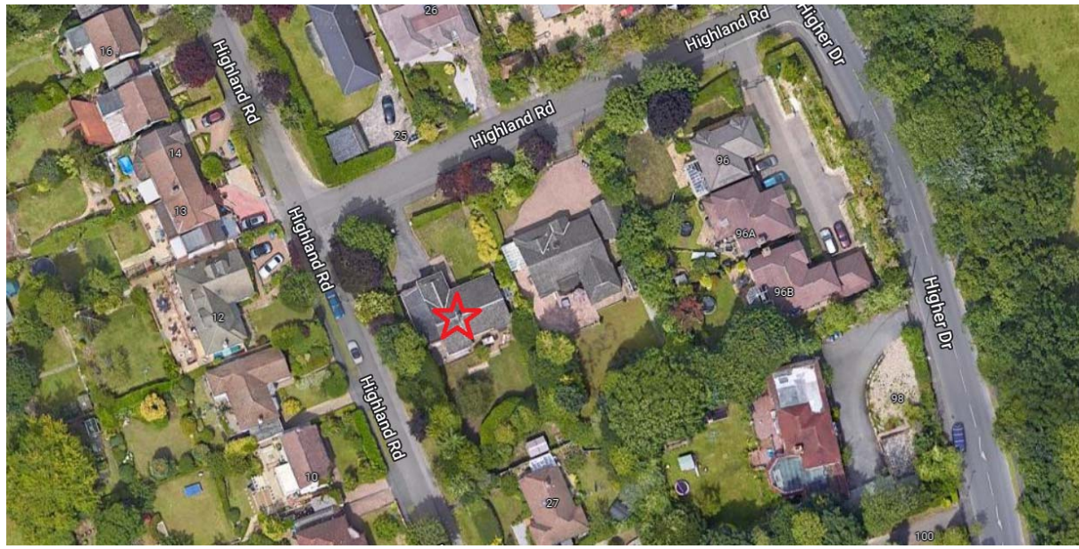
Figure 2 – the application site

4.1 The application site lies of the southern side of Highland Road in the ward of Kenley and is currently occupied by a large, detached property within a generous plot. The land rises sharply to the north-east and falls to the south-west, whilst to the south land levels are fairly flat towards the neighbouring property at 27 Highland Road. The existing property dates to the post-war era and while not of high architectural quality the existing dwellings contributes to the sites suburban setting.